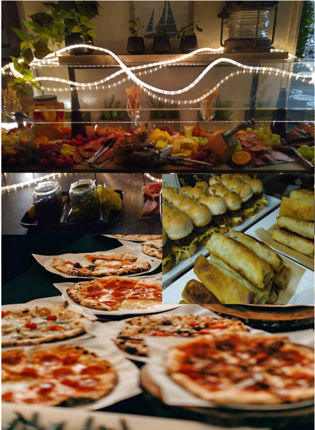
Pizza , Antipasto Boards, Savoury pastry platter or Sausage Sizzler